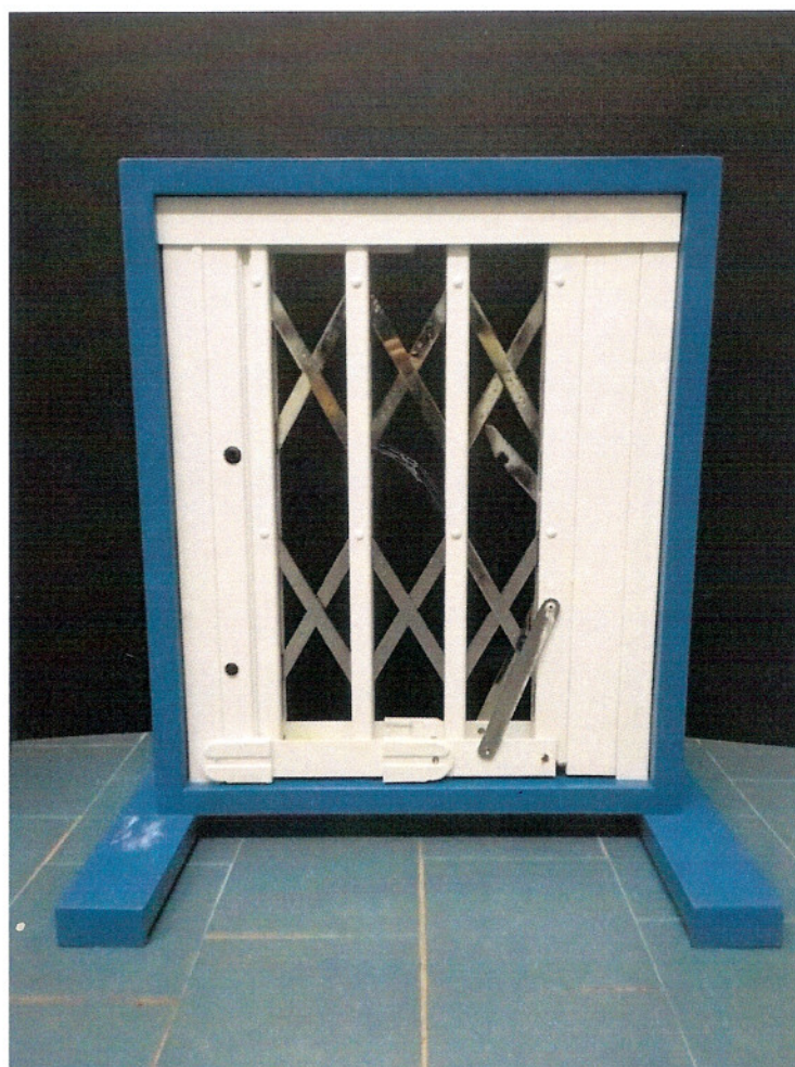
Photo of specimen at end of test